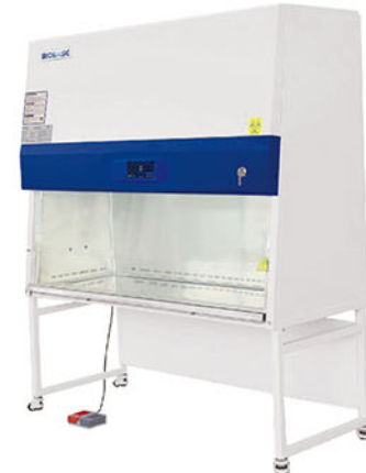
Color Touch Screen Type