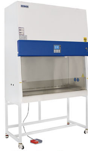
Button Screen Type