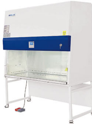
Button Screen Type