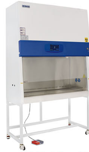
Color Touch Screen Type