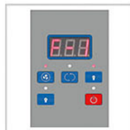
LED Display Digital LED display: Airflow Level