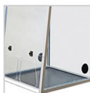
Three Side Glass Windows Back&Side glass windows maximize light and visibility, providing a bright and open working environment