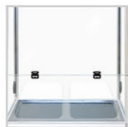
Folding acrylic front window, down part with free stop function