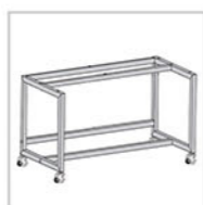
Base Stand Optional